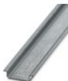
DIN rail, material: Galvanized, unperforated, height 7.5 mm, width 35 mm, length: 2 m

DIN rail, unperforated - NS 35/ 7,5 ZN UNPERF 2000MM - 1206434