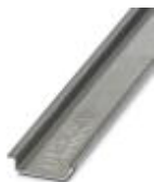
DIN rail, unperforated, Width: 35 mm, Height: 7.5 mm, Length: 2000 mm, Color: silver

DIN rail, unperforated - NS 35/ 7,5 AL UNPERF 2000MM - 0801704