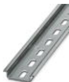
DIN rail, material: Galvanized, perforated, height 7.5 mm, width 35 mm, length: 2 m

DIN rail perforated - NS 35/ 7,5 ZN PERF 2000MM - 1206421